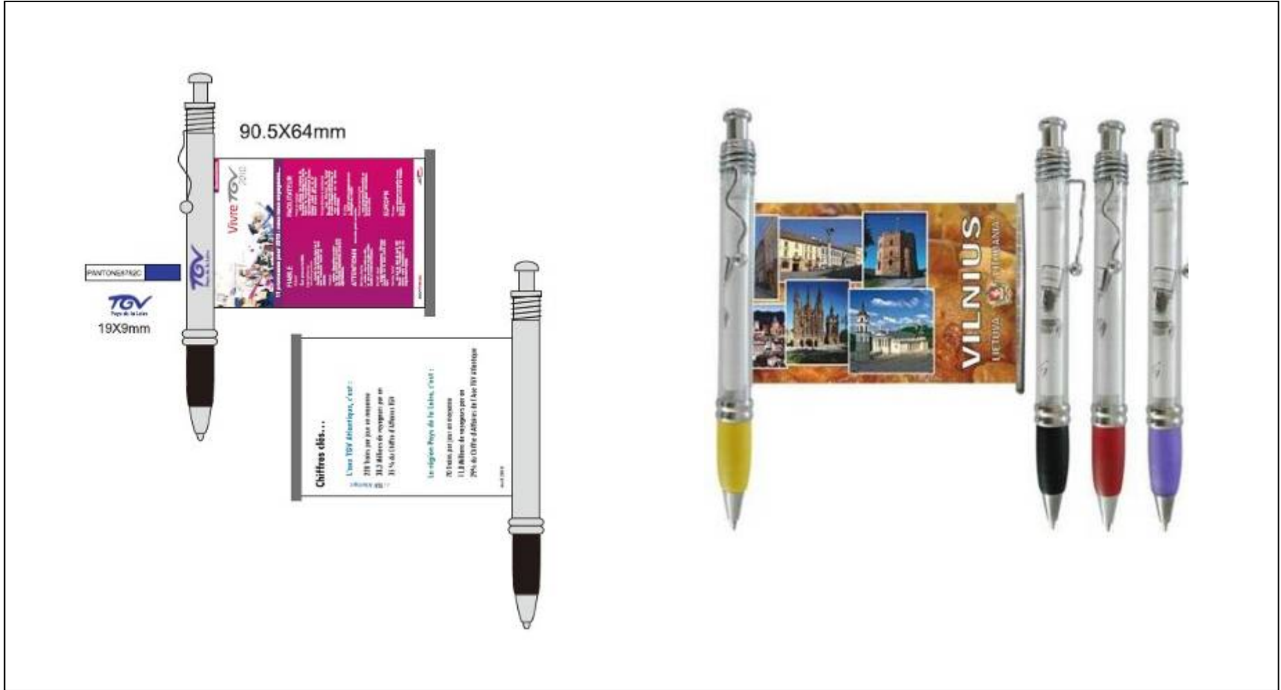
DSP-B006 Metal Banner Pen – Ball Ink