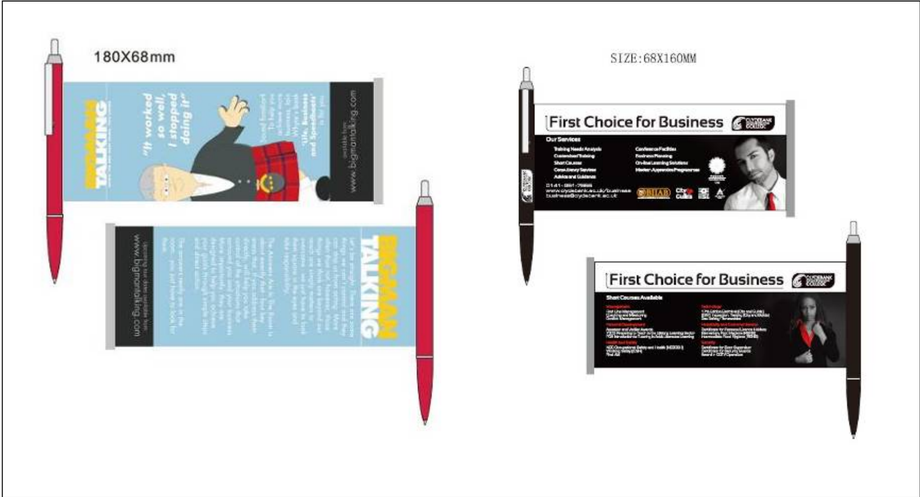
DSP-B005 Metal Banner Pen – Ball Ink