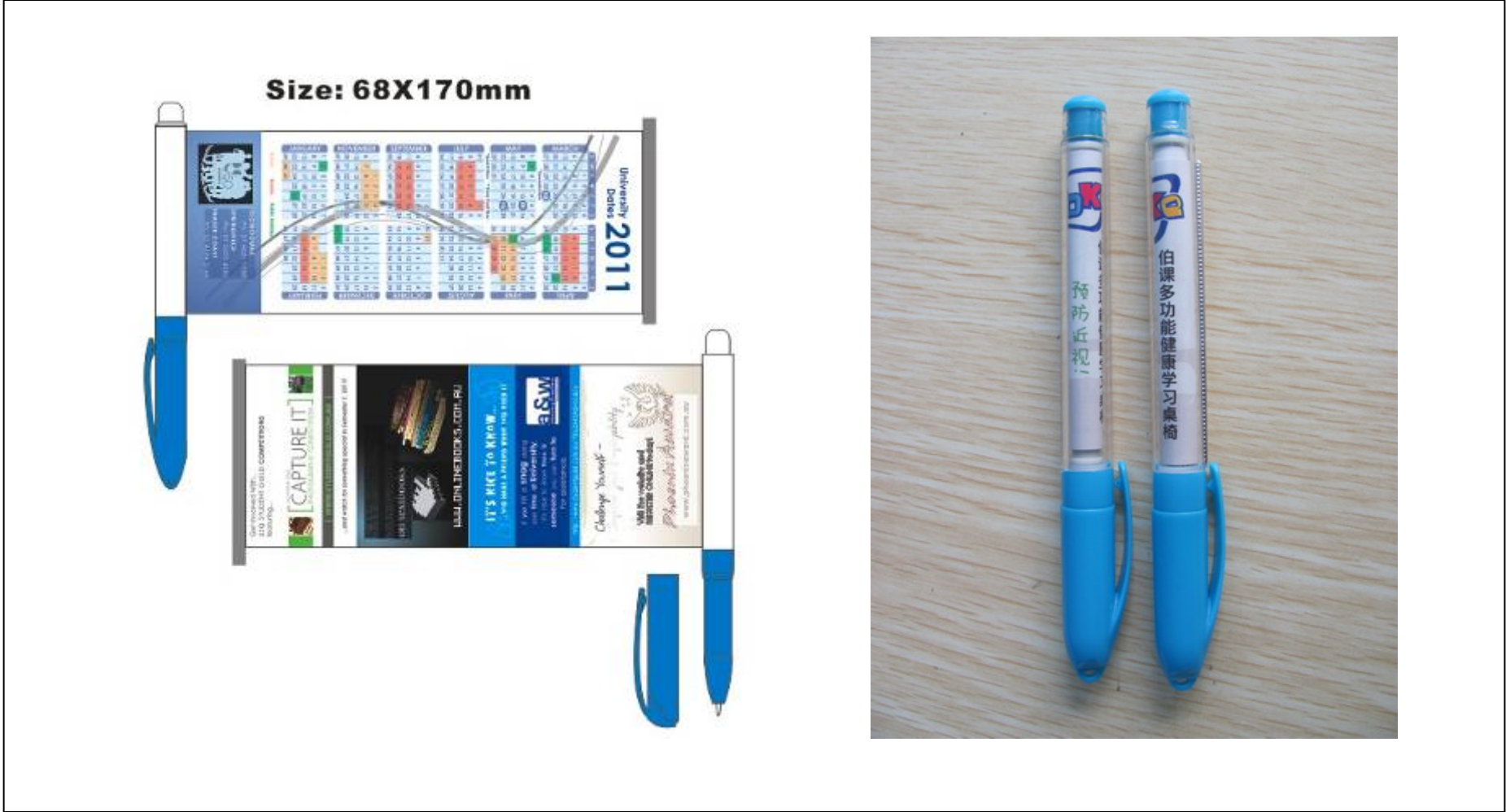
DSP-B004 Plastic Banner Pen - Gel Ink