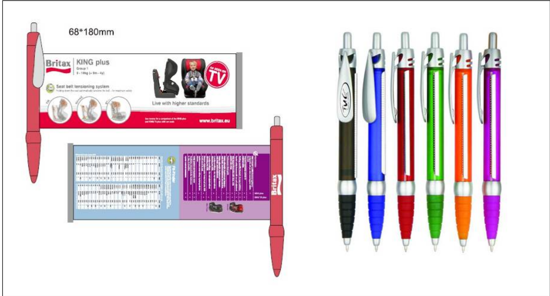
DSP-B003 Plastic Banner Pen – Ball Ink