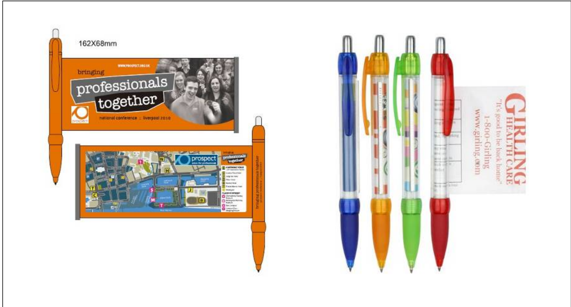
DSP-B001 Plastic Banner Pen – Ball Ink