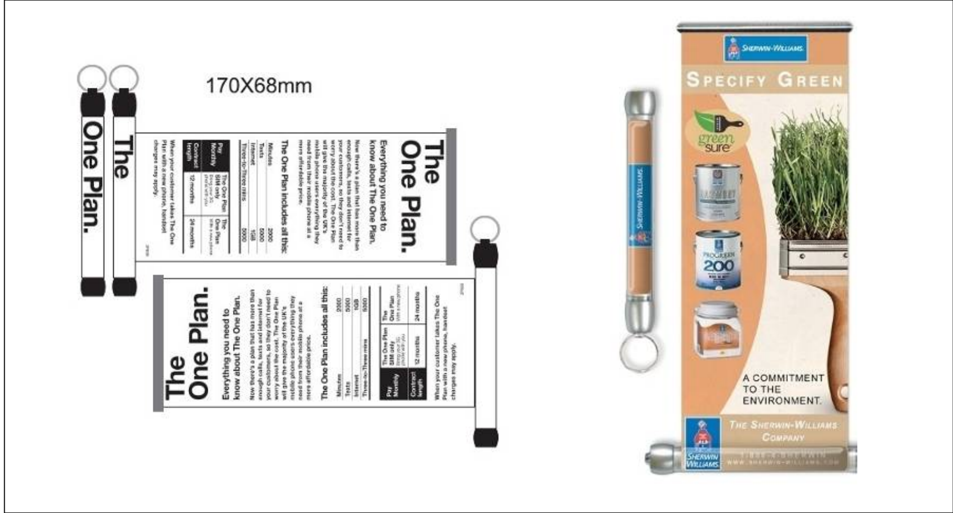
DSP-BK001 Banner Keyring