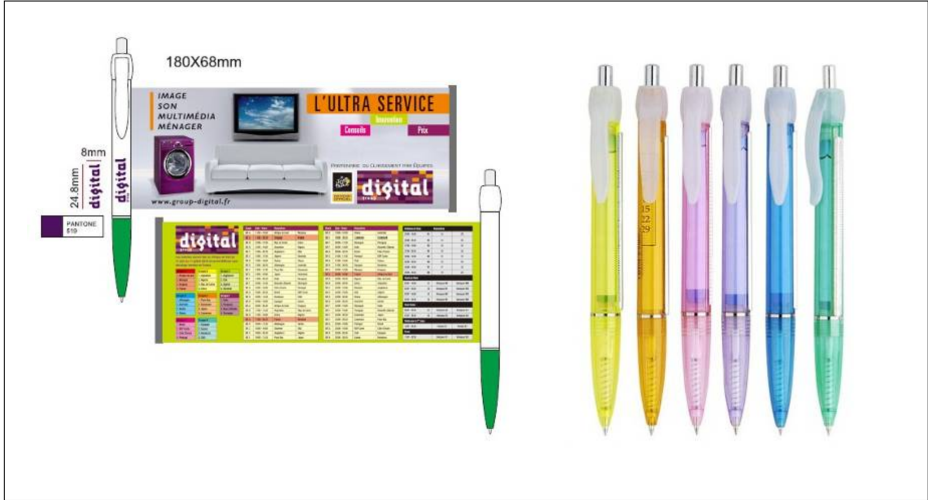
DSP-B002 Plastic Banner Pen – Ball Ink