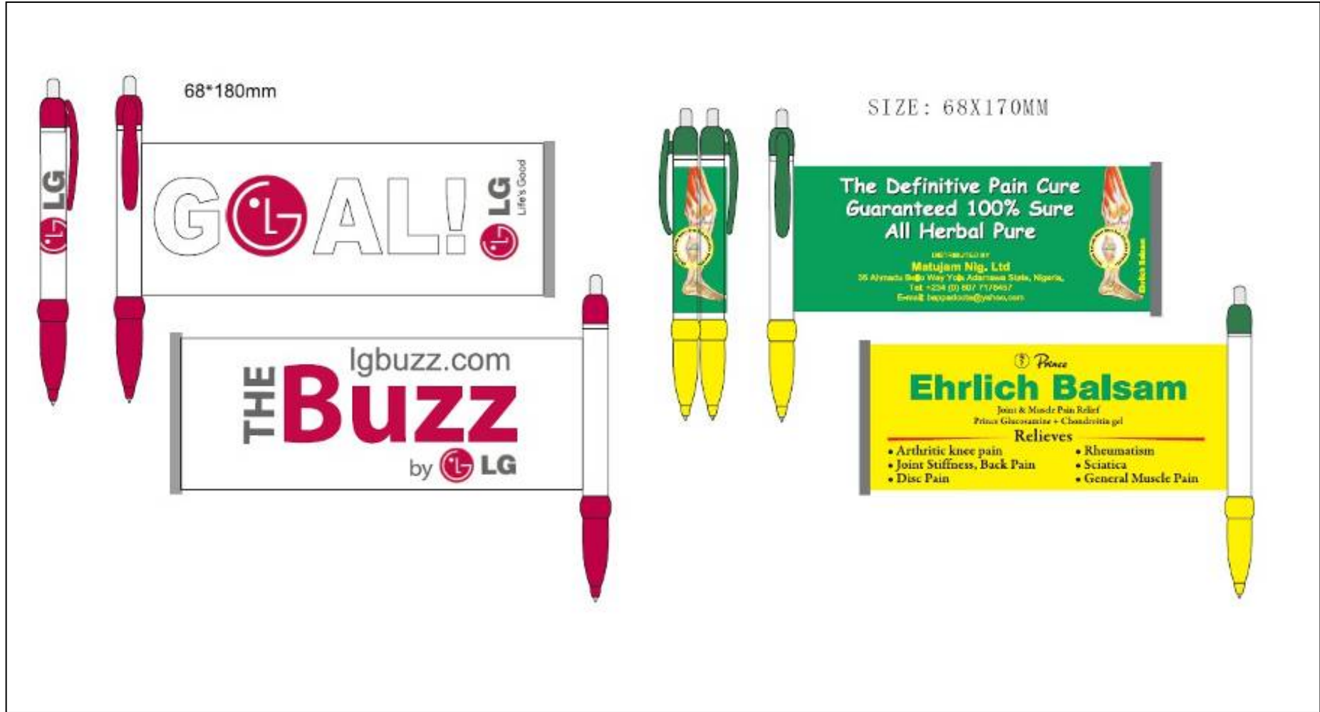
DSP-B001 Plastic Banner Pen- Ball Ink